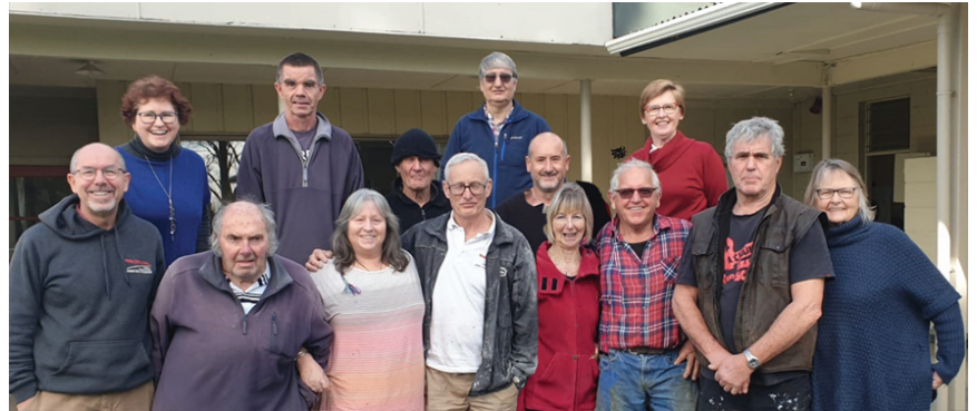
All those at morning tea one morning on the MMM project